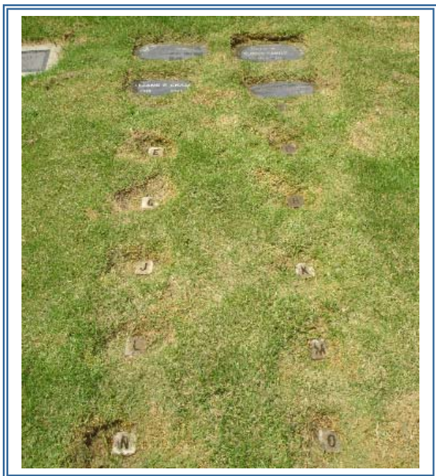
Chase Family cremation plots

My family has always been concerned with the maintenance of Savannah and the remains of our ancestors. As far back as my preteen years I remember visits to the cemetery to clean graves and place flowers. My father wrote in 1963, ". . . this ground was dedicated to pioneer families; this will continue forever . . ." We all need to work toward that goal and creative ideas, like my father's, can help preserve Savannah.